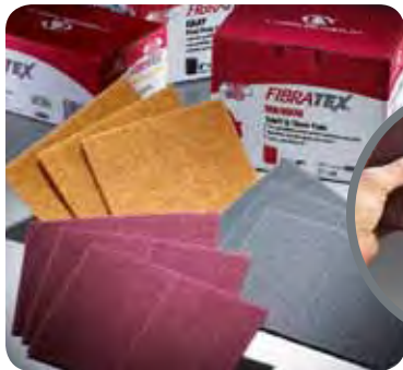
Fibratex Scuff Pad